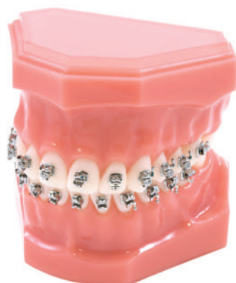
T3411-00 DEMONSTRATION MODEL - INTERACTIVE SL