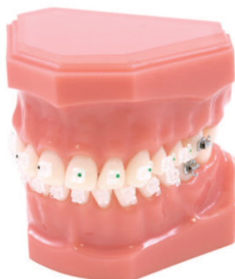
T3456-00 DEMONSTRATION MODEL - GHIACCIO