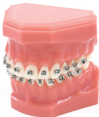
T3442-00 DEMONSTRATION MODEL - MIDI DIAGONALI