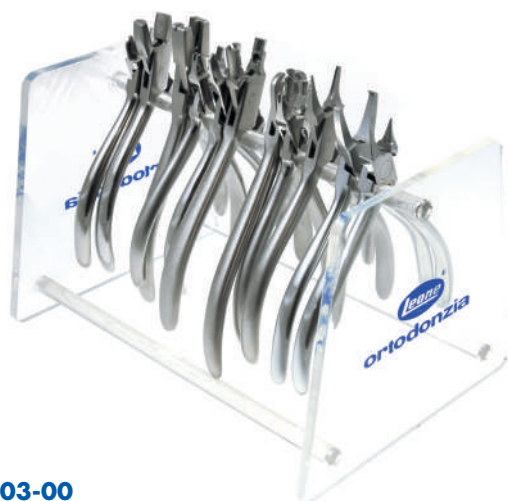
T1203-00 PLIER RACK