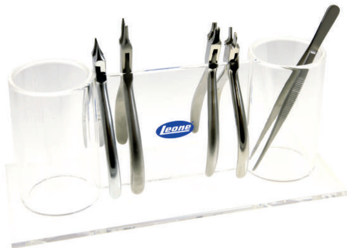
T1200-00 PLIER RACK