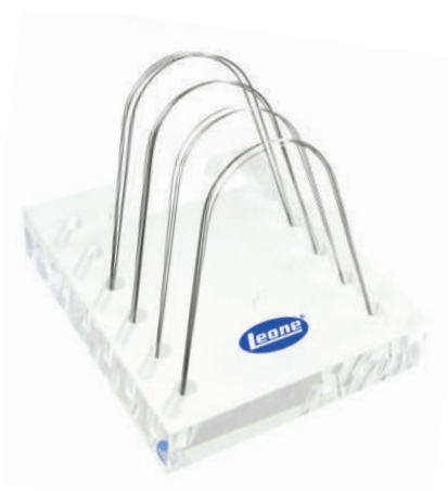
T1212-00 STANDARD ARCHWIRE HOLDER