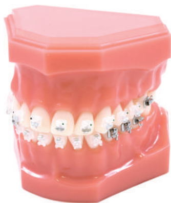
T3457-00 DEMONSTRATION MODEL - AQUA SL