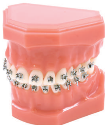
T3461-00 DEMONSTRATION MODEL - STEP SYSTEM 2.0