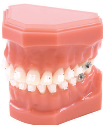
T3458-00 DEMONSTRATION MODEL - AQUA